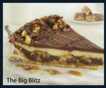
The Big Blitz