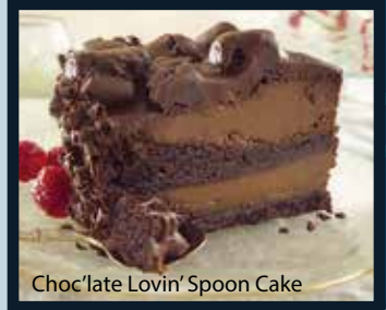
Choc'late Lovin' Spoon Cake

A lemonade inspiration, with layered lemon cake, a cool lemon mousseline and Meyer lemon curd 5.49