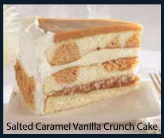
Salted Caramel Vanilla Crunch Cake